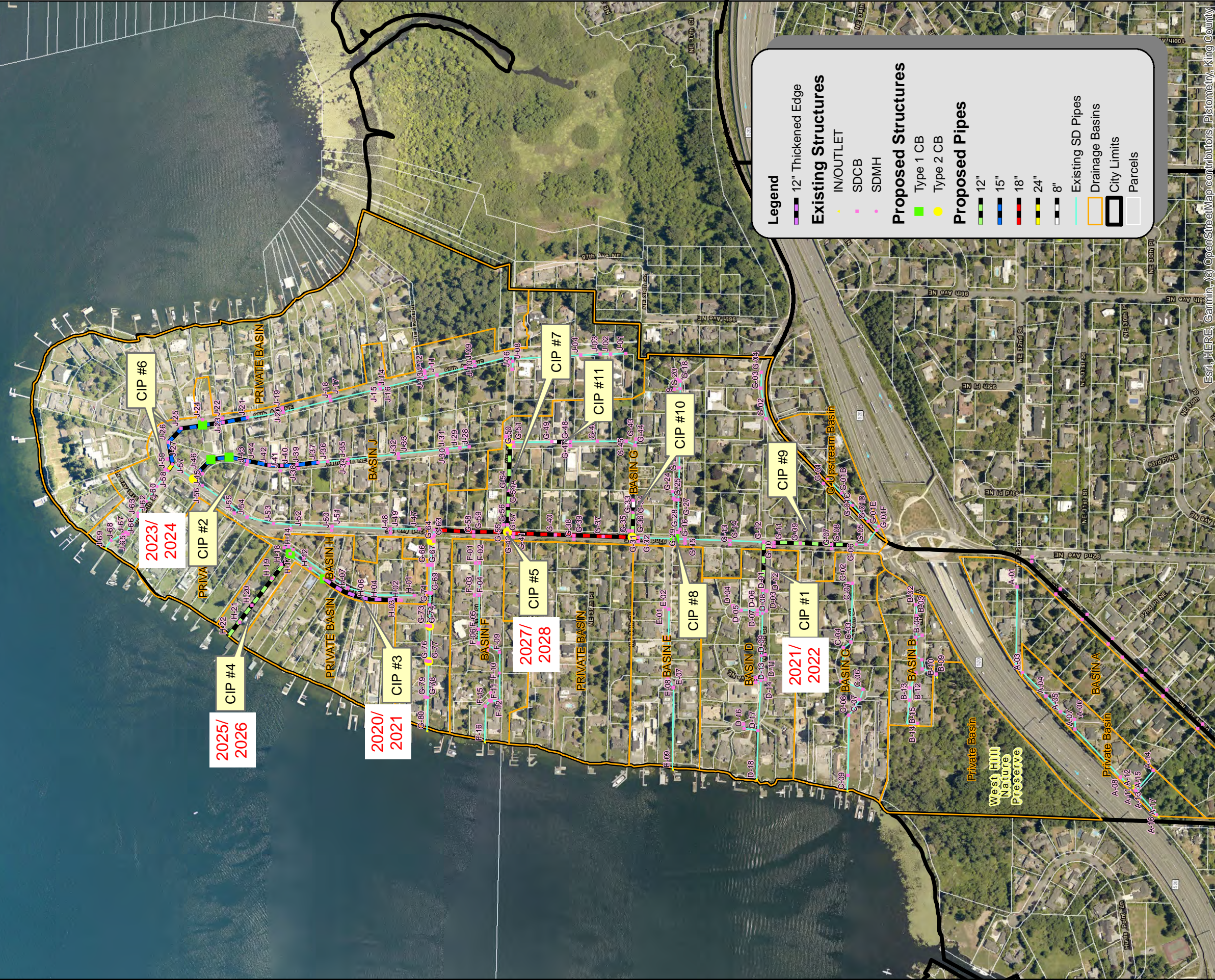
TOWN OF YARROW POINT CAPITAL IMPROVEMENT PROJECTS FIGURE 5-1